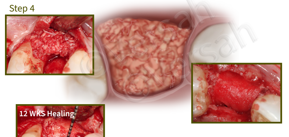
Step 4: Graft the newly formed socket/osteotomy including surrounding area with your preferred bone allograft materials, preferably a 70/30 cancellous/cortical ratio. Use membrane and try to achieve tension free primary closure. Allow healing for 3-6 months.