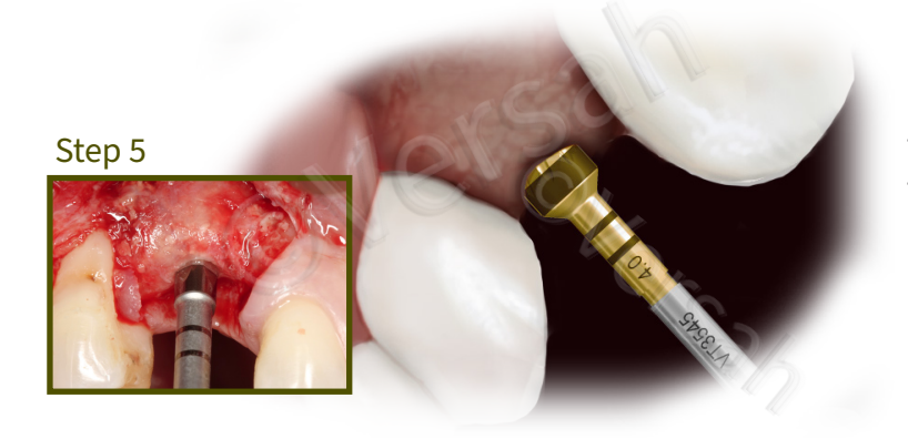
Step 5: Re-enter the site and perform Osseodensification to facilitate further expansion if needed and place the implant. Use the Densah™ Burs in smaller increments. Do not under-prep the osteotomy beyond 0.5 mm - 0.7 mm in the maxilla or 0.2 mm - 0.5 mm in the mandible.